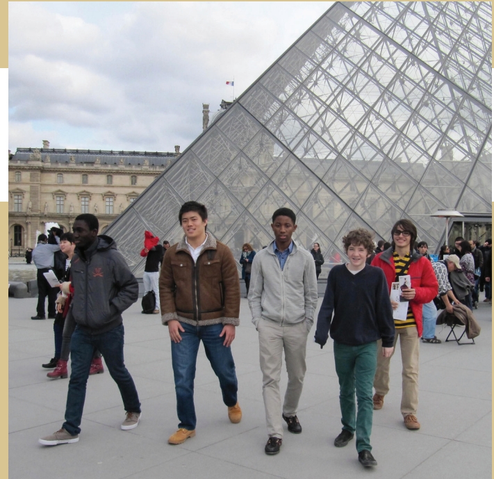
Spring break trip to Europe, 2014

Faculty provide travel opportunities during school vacations. Some of the recent destinations have included Europe, South America, the Caribbean, as well as adventure trips for skiing, white water rafting, camping and exploring in the American West.