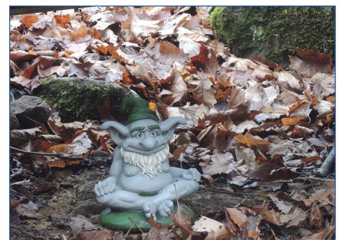
Elder the Troll

One small way in which electronics and the outdoors may come together, though, is through the Mountain Biking (MTB) Project app. This app offers the location of all of the trails on the Blue Ridge campus. You'll find the School listed under St. George in Central Virginia. Have fun! And don't forget to check on Elder!